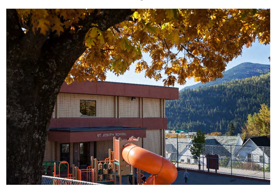
This is my school.

I will get dropped off at school in the morning.