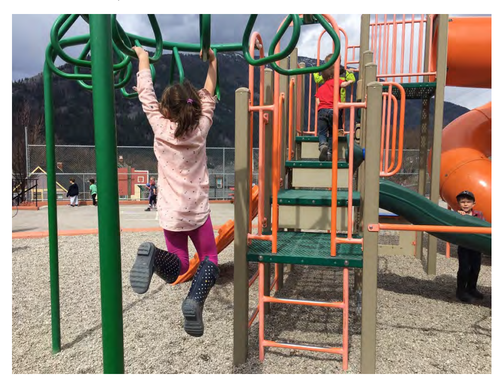
I will also get to play in the gym.

I will get to play outside with my new friends.