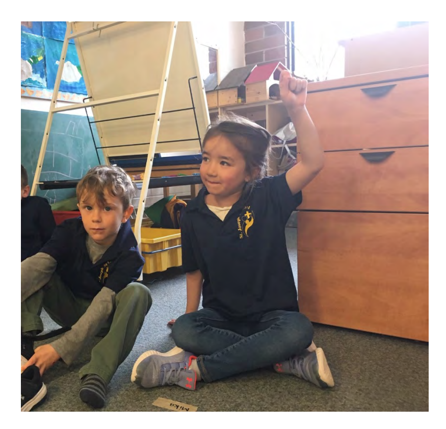
I need to remember to wash my hands.