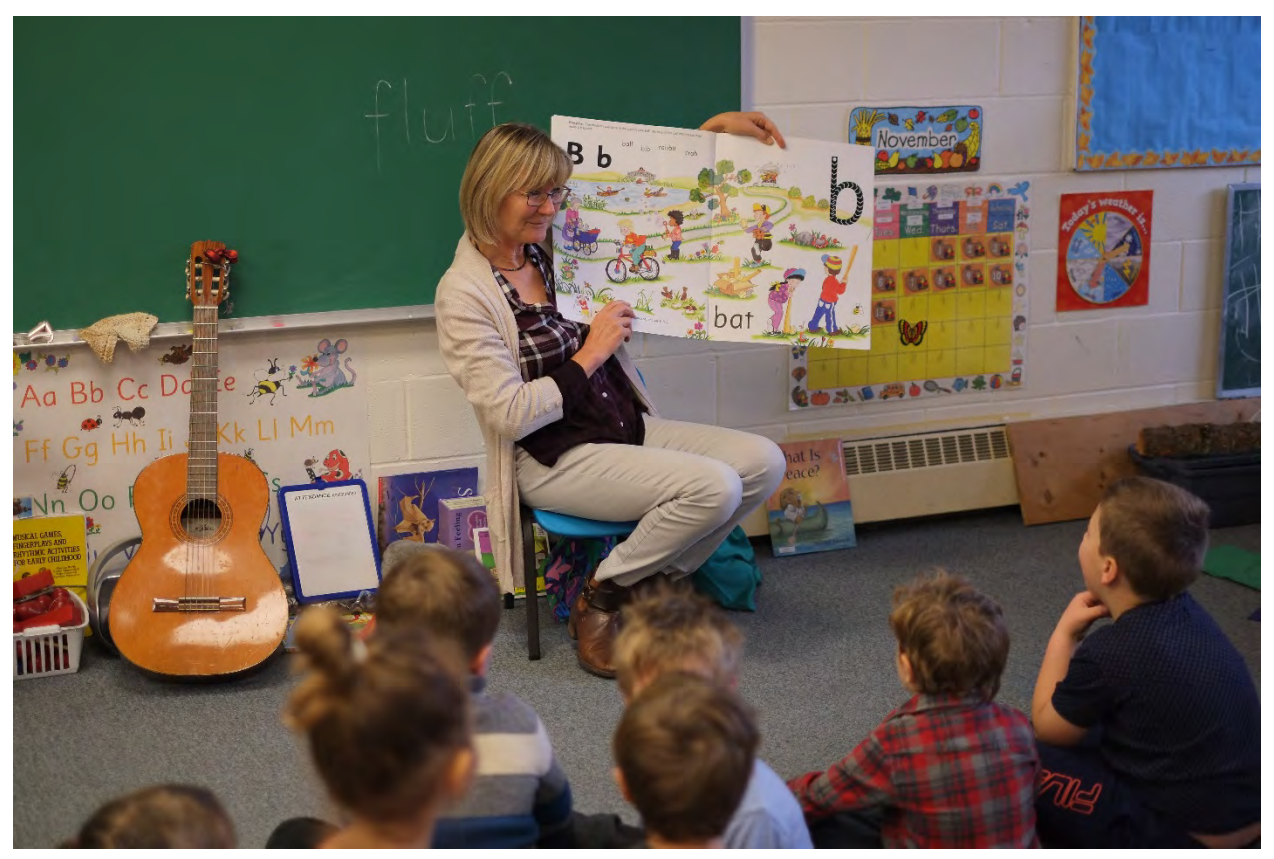
My teacher is there to help me.

During kindergarten we will work and have circle time and do fun art activities.