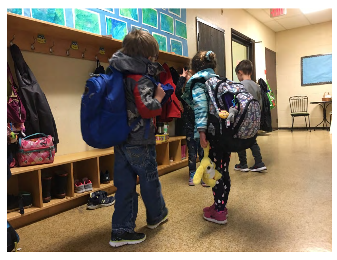
I will meet new friends in kindergarten

When school is finished I will pack my bag and get ready to go home.