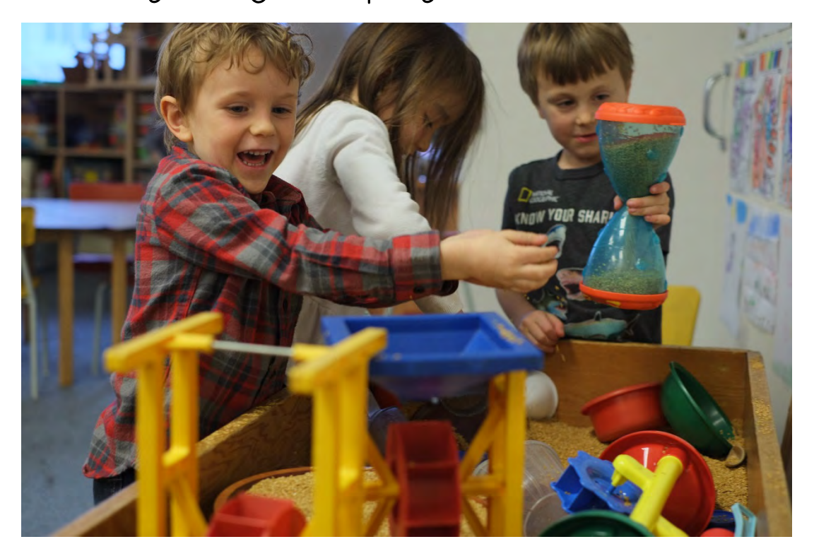
Afterwards we tidy up too!

Each day we get to play at different centers.