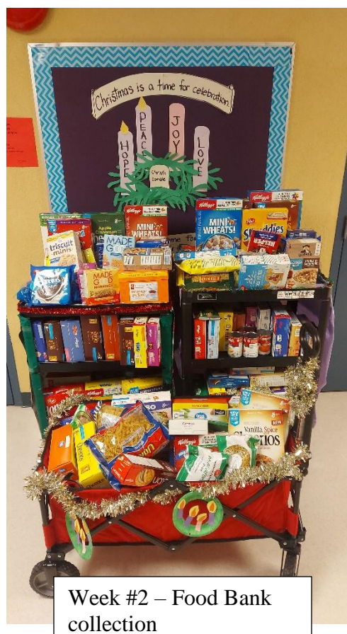
Week #2 – Food Bank collection