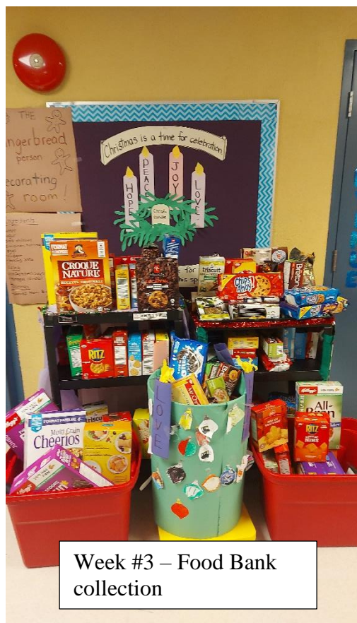
Week #3 – Food Bank collection

Thanks to all students for participating in the Advent Collection for the Cranbrook Food Bank.