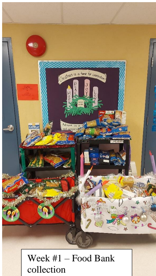
Week #1 – Food Bank collection